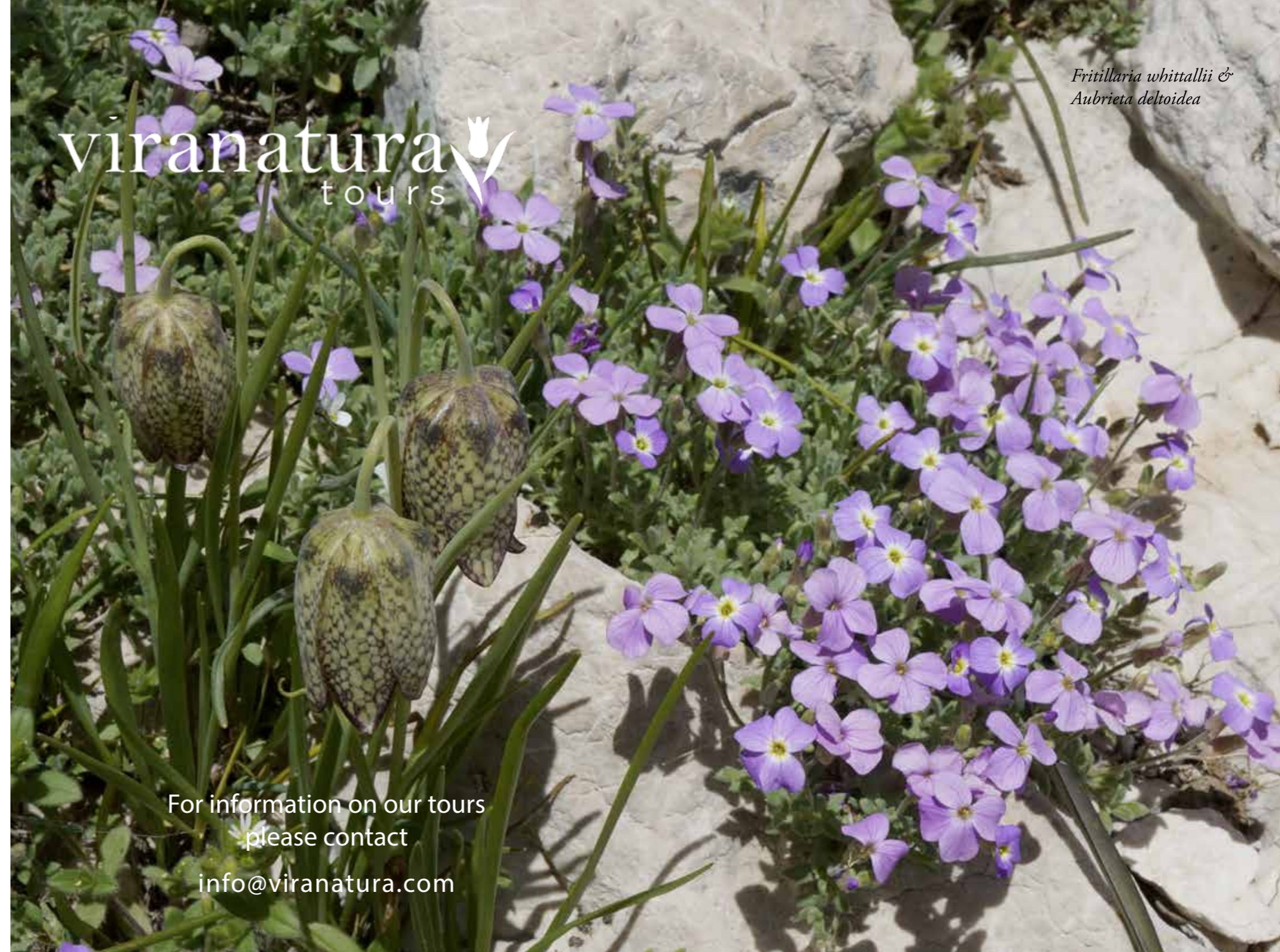
Fritillaria whittallii & Aubrieta deltoidea